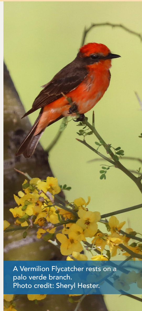
A Vermilion Flycatcher rests on a palo verde branch.