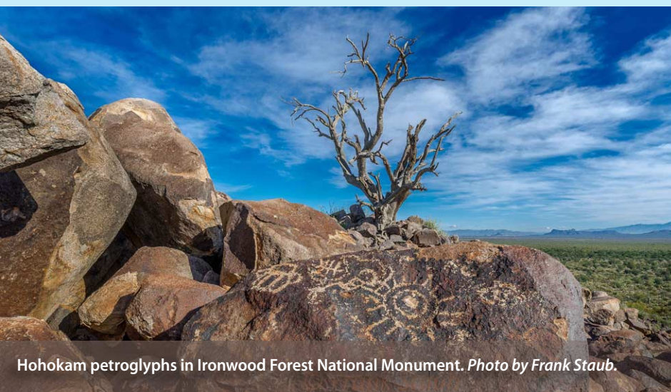
Hohokam petroglyphs in Ironwood Forest National Monument.