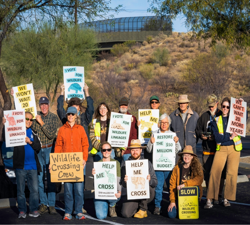
Community members rally for full funding of wildlife crossings in the RTA Next draft plan at the Oracle Road wildlife bridge, seen in the background.