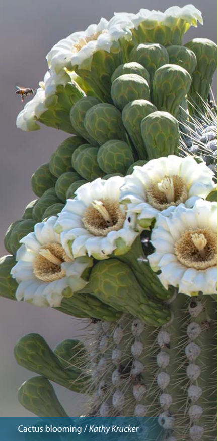
Cactus blooming / Kathy Krucker