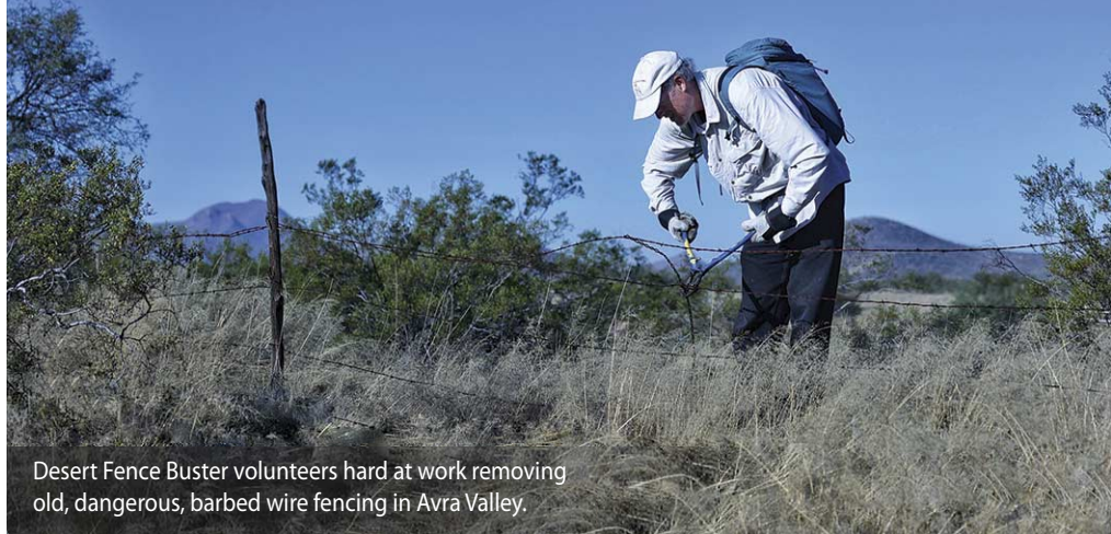
Desert Fence Buster volunteers hard at work removing old, dangerous, barbed wire fencing in Avra Valley.

Our Desert Wildlife Internship program is funded by the Deupree Family Foundation.