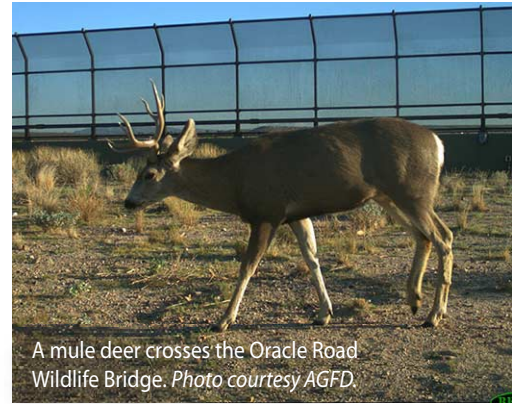
A mule deer crosses the Oracle Road Wildlife Bridge.

This tour was spearheaded by Beth Pratt, a lifelong wildlife advocate with the National Wildlife Federation, and inspired by P-22, the famous mountain lion that catalyzed the construction of the massive Wallis Annenberg wildlife bridge over the 101 freeway in Los Angeles. After the passing of P-22 earlier in 2023, Beth and her team decided to spread awareness of the importance of wildlife crossings in urban spaces even further.