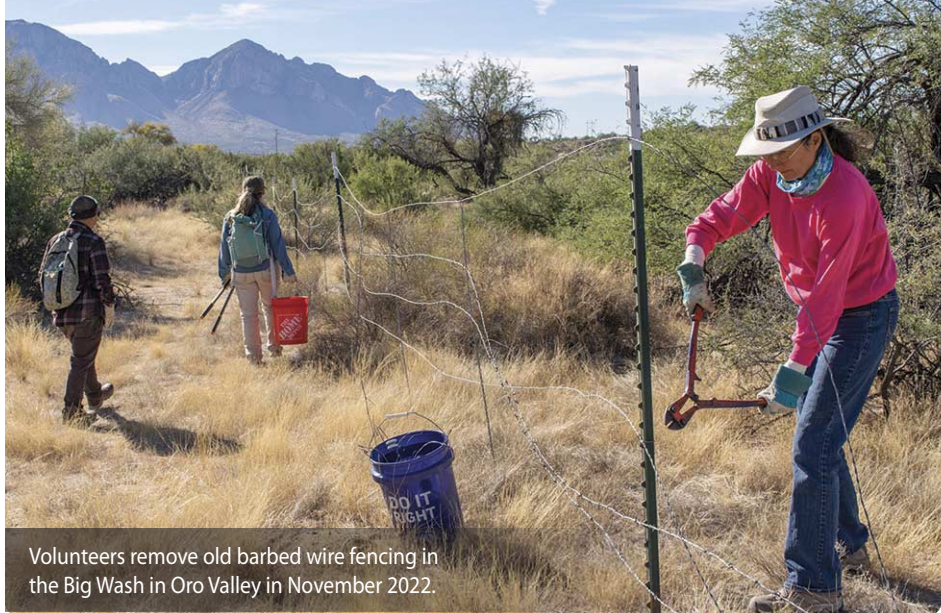
Volunteers remove old barbed wire fencing in the Big Wash in Oro Valley in November 2022.